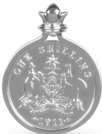
Catalogue No. 23

Coat of Arms Shilling Pendant 1910. $139 A piece of Australian history, this is an original coin that has been restored to become a timeless piece of jewellery.