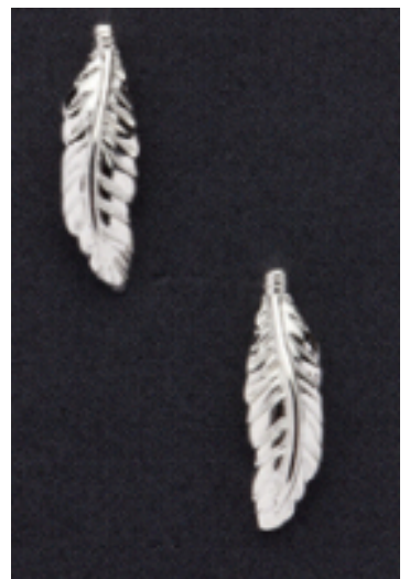
Catalogue No. 09