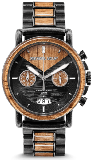
Catalogue No. 01

Mens Chronograph Alterra Watch. $569 Made from Koa Wood from Hawaii with a stonewashed band for that distressed look.