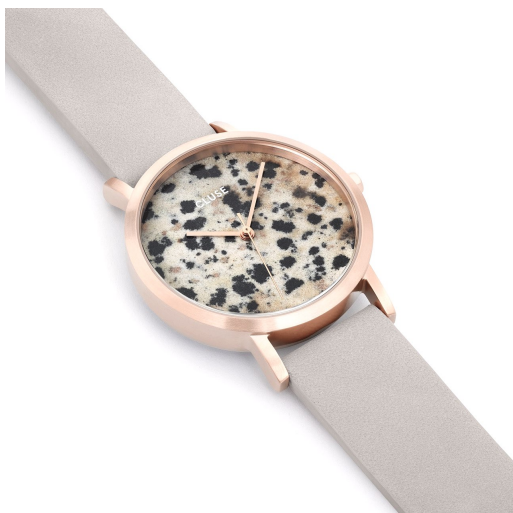
Catalogue No. 15

La Roche Petite Watch. $199 Talk about seeing spots! This little cutie has a real slice of Dalmatian marble for its face making it unique to its wearer, set off with rose gold its the perfect watch for any occasion!