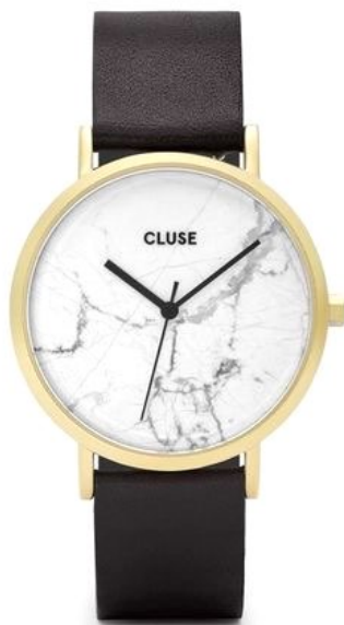
Catalogue No. 13

La Roche Marble Watch. $249.00 This stunner has a real slice of marble in the face so every single one is individual. Its an all round beauty but with a minimalist design, so why not treat yourself!