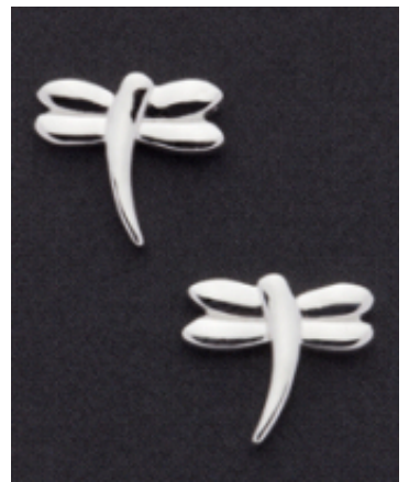
Catalogue No. 08