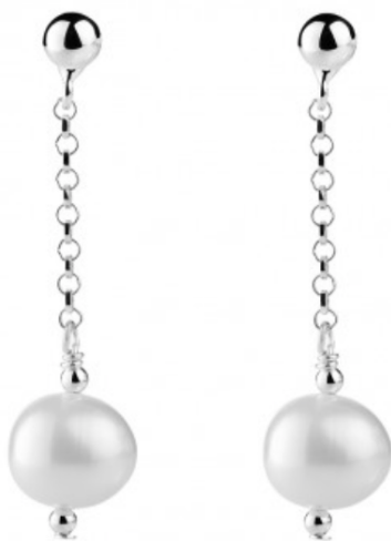
Catalogue No. 20

Snowdrop Pearl Drop Stud Earrings. $89 When the occasion calls for remarkable, slip on these stunners, inspired by soft light whispers through the rainforest canopy. The lustrous 8mm pearls swing in ethereal splendour from their polished sterling silver balls and chains.