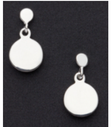
Catalogue No. 07