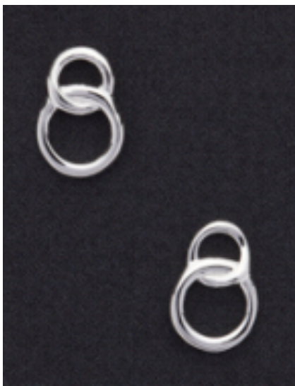
Catalogue No. 05