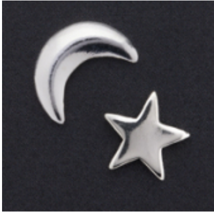
Catalogue No. 04