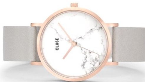
Catalogue No. 17

La Roche Watch. $249 This beauty has a real slice of marble in the face so every single one is individual to the next. Its an excellent all rounder with a minimalist design, so why not treat yourself!