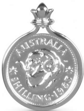
Catalogue No. 21

Rams Head Shilling Pendant 1941. $119 A piece of Australian history, this is an original coin that has been restored to become a timeless piece of jewellery.